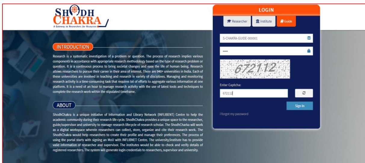
Figure 1: Guide Login Page

Login: The Nodal officer will provide credentials to access the portal to approved Guides.